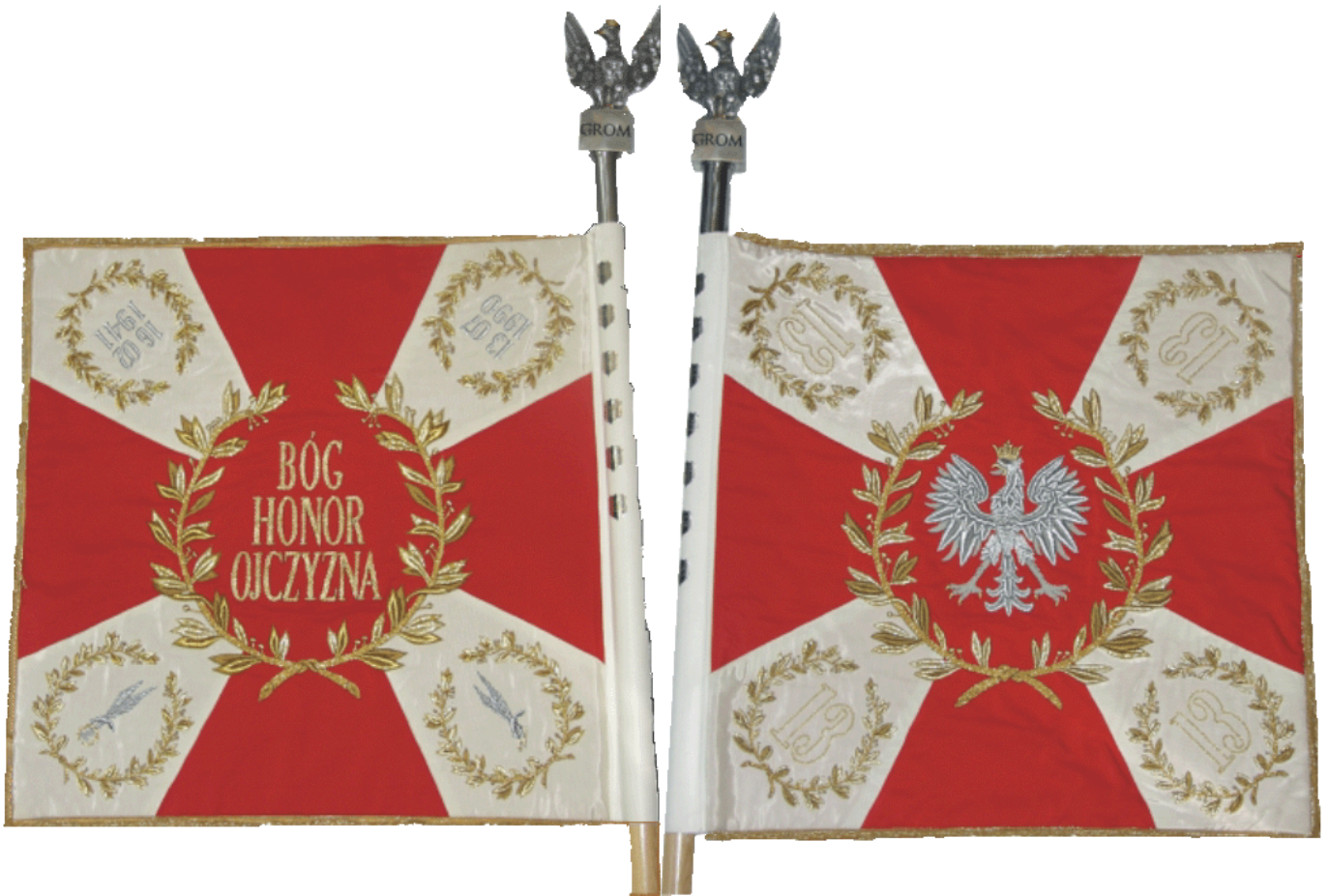
Flag of Military Unit GROM

The flag of the Unit includes, among other things, the date of the first airdrop of Cichociemni (The Silent Unseen) to occupied Poland - February 15/16, 1941, the date of creation of the Operational Maneuver Response Group - July 13, 1990, the symbolic GROM number "13", Cichociemni parachute badge and, modelled on it, the Unit GROM badge in the form of a nosediving golden eagle with a thunderbolt ("thunder" means "grom" in Polish) in its claws; in the middle of the Knight's Crosses there is an image of a white eagle, and on the other side there is the inscription: "God, Honor, Fatherland". "The godparents" of the flag were: the wife of the first commander of GROM Mrs. Agnieszka Petelicka and one of Cichociemni, officer of the Home Army, Second Lieutenant Bronisław "The Reel" Czepczak - Górecki.