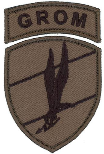
battle dress uniform

An identification patch (worn on the right shoulder) for soldiers of GROM combat squadrons.