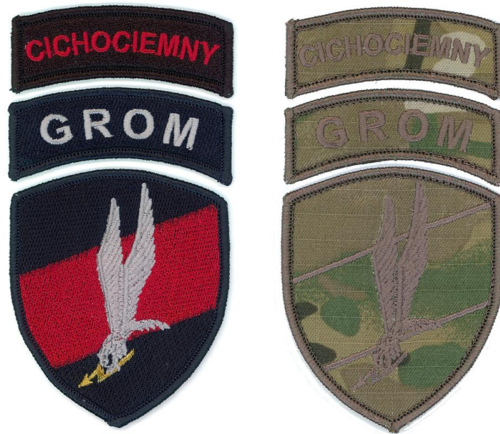
Badges of the corps