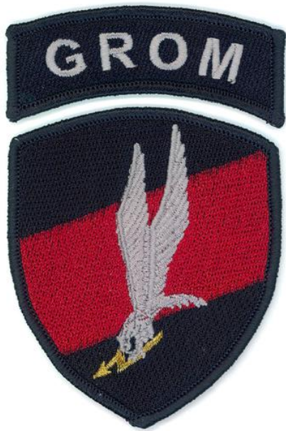
service dress uniform