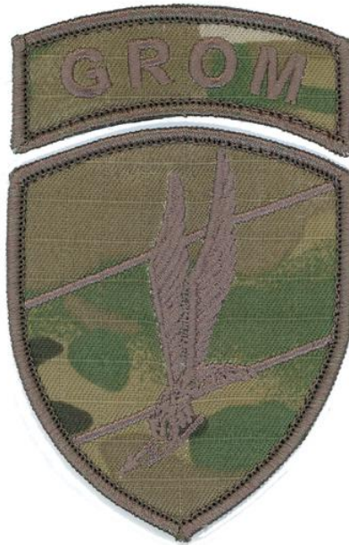
desert dress uniform